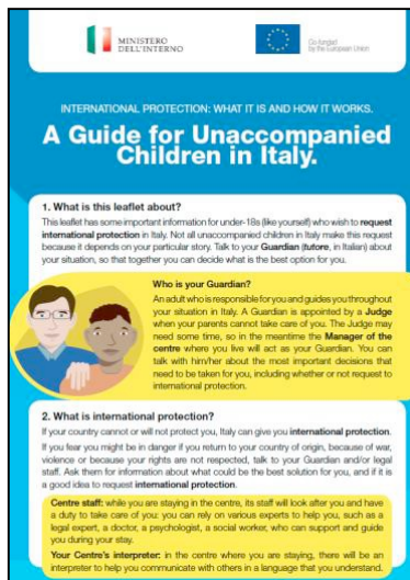
Image 1. Page from UNHCR Guide for UAMs

Specific media channels are employed by agencies primarily to deliver information. A child-friendly brochure has been produced by UNHCR in the form of a 'guide' to assist the work of reception centres' staff in delivering clear information to children on the steps of the asylum seeking process. A video has also been produced more recently to detail the process visually. All materials are produced by the agency either in collaboration with the Italian Ministry of Interior or in consultation with the Italian Authority for Children and Adolescents, the body responsible for the implementation of the principles established by the UN Convention on the Rights of the Child in Italy. IOM makes use of images and comic strips presented in PowerPoint slides to convey difficult notions on work exploitation. These visual materials help in providing practical examples of what does not conform with the Italian Labour Law. UNICEF utilises Facebook to provide